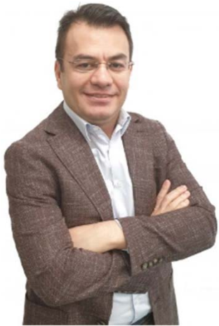
Structural Eng. (M.Sc)